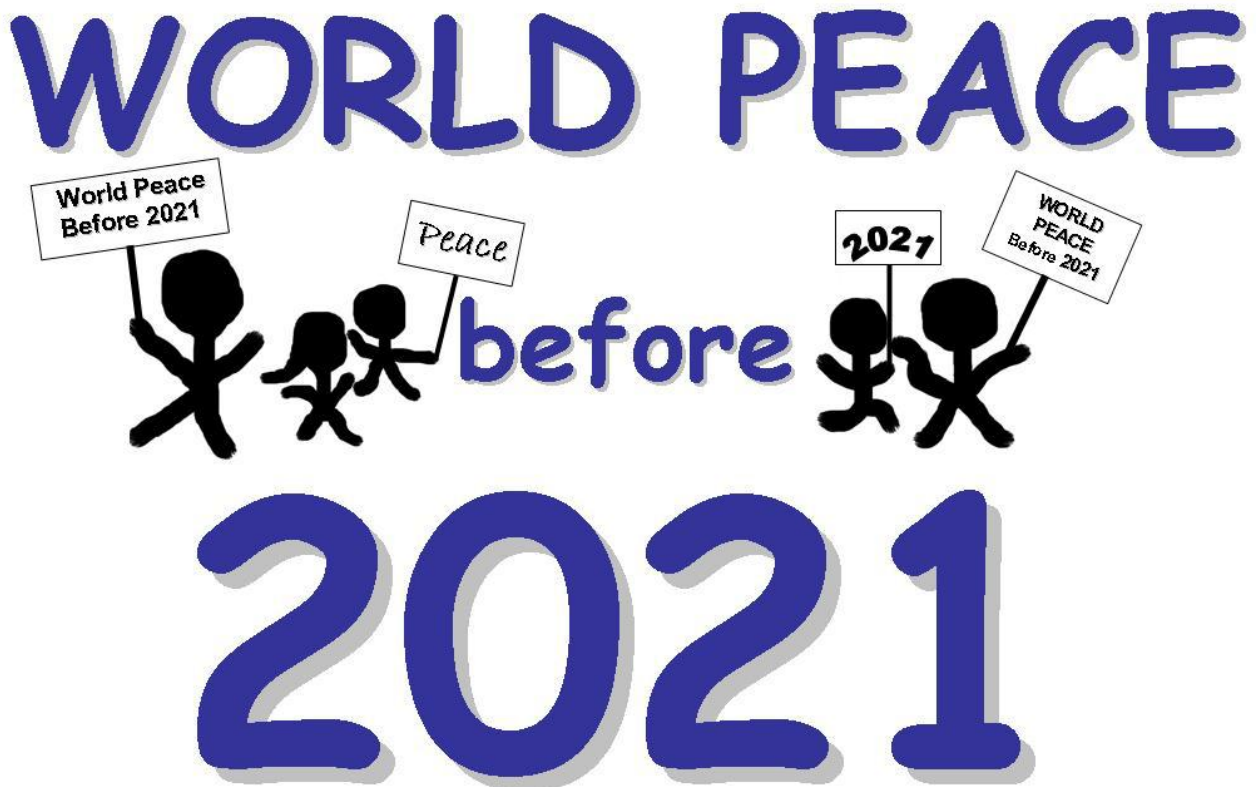
World Peace Before 2021 – Logo

World Peace Before 2021 – Available on www.worldpeacebefore2021.com